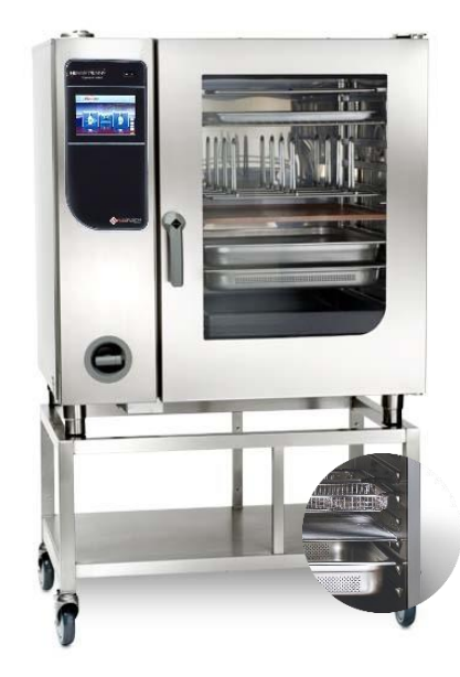
FPE 115 on short base INSET: Available rail insert for easy pan storage