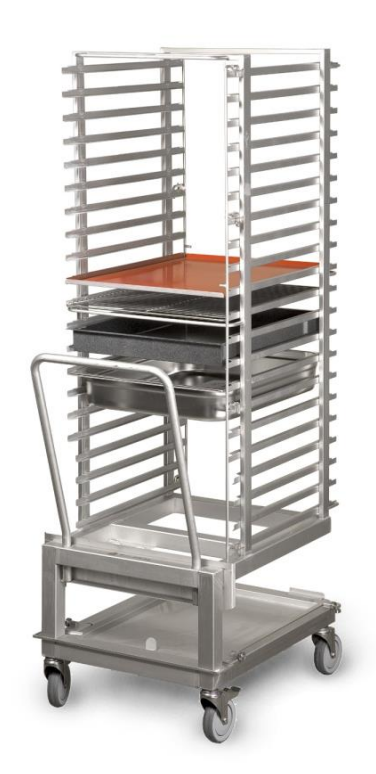
MOR 221 for 2/1 GN pans or two full-size steam table pans crosswise

Mobile oven racks for Henny Penny For FlexFusion models 215/221 FlexFusion combi ovens help make combi cooking and cook/chill programs more productive.