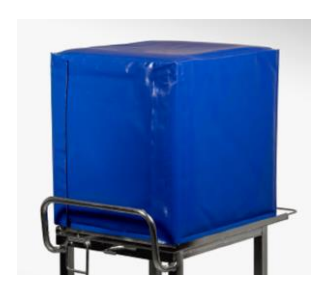
Insulated covers help maintain food temperature for up to 20 minutes