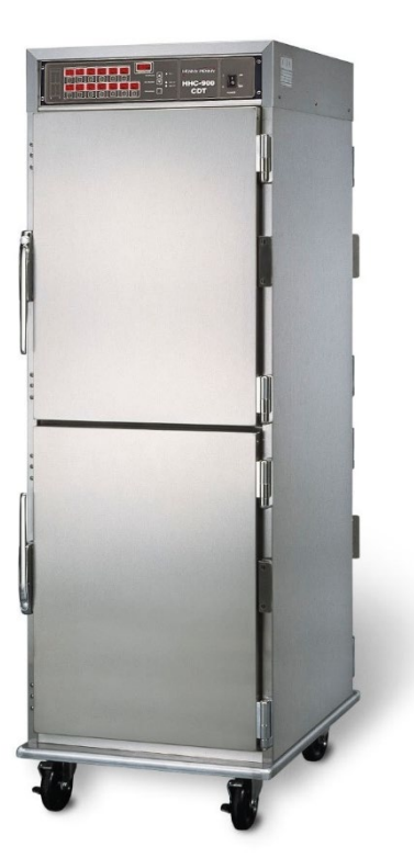
HHC 900 full-size heated holding cabinet with Countdown Timer control

Henny Penny heated holding cabinets keep hot foods safe and appetizing prior to serving.