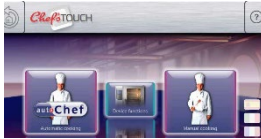
Chef's Touch control: Just tap and swipe to run built-in apps

The FlexFusion Team combi Platinum Series features two independent Chef'sTouch control systems on one convenient eye-