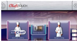
Chef's Touch control: Just tap and swipe to run built-in apps

The FlexFusion Team combi Platinum Series features two independent Chef'sTouch control systems on one convenient eye-