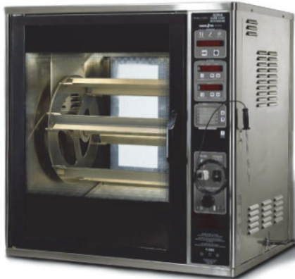
SCR-6 countertop 6-spit rotisserie